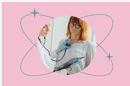
Medical Gaslighting: Study Reveals 72% of Millennial Females Feel Dismissed by Doctors