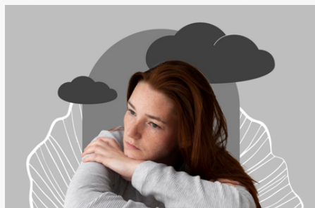
Mental health & Fertility: 8 out of 10 reported anxiety while trying to conceive