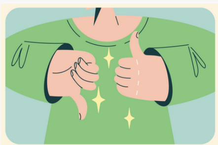
Mira Study: How Sex Hormones Affect Mood & Well-being