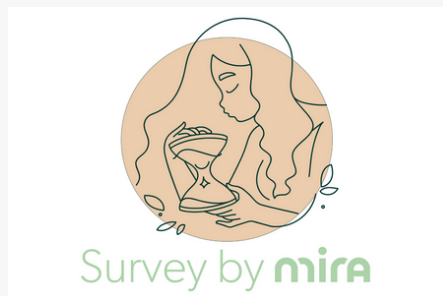
Mira Survey: 65% of US women didn't check their sex hormones during the past year